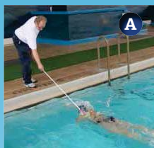
Image A: a "tapper" used by a coach to signal the need to turn Image B: a sprinkler system to signal a turn without the coaches assistance